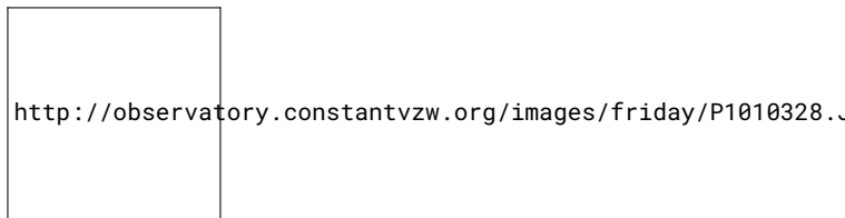
Figure 0.1: Techno-Galactic Software Observation team, WTC Brussels, June 2017

Do you suffer from the disappearance of your software into the cloud, feel oppressed by unequal user privilege, or experience the torment of software-ransom of any sort? Bring your devices and interfaces to the World Trade Center! With the help of a clear and in-depth session, at the Techno-Galactic Walk-In Clinic we guarantee immediate results. The Walk-In Clinic provides free hands-on observations to software curious people of all kinds. A wide range of professional and amateur practitioners will provide you with Software-as-a-Critique-as-a-Service on the spot. Available services range from immediate interface critique, collaborative code inspection, data dowsing, various forms of network analyses, unusability testing, identification of unknown viruses, risk assessment, opening of black-boxes and more. Free software observations provided. Last intake at 16:45 (invitation to the Walk-In Clinic, June 2017)