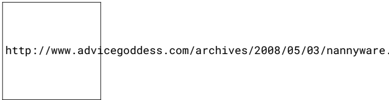
Figure 0.3: Content-control software

never had any problem at all (using the computer, that is), then you may want much fewer breaks, say 10 seconds micropause every 10 minutes, and a 5 minute restbreak every hour. It is very hard to give proper guidelines here. My best advice is to play around and see what works for you. Which settings "feel right". Basically, that's how Workrave's defaults evolve. (from http://www.workrave.org/documentation/faq/ )